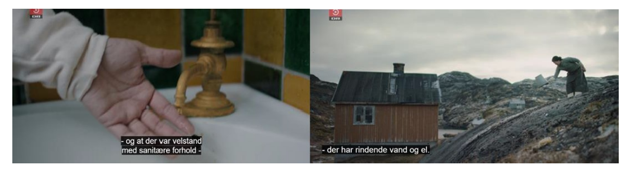
Image 4 and 5 In Episode 3, the series shows how different bathrooms are in the early 1900s in Denmark and Greenland, illustrating the vastly contrasting living conditions in the two countries.

to Greenland (Ep. 3, 6:44-57) and "(...) that Danes were very clean and lived in big houses, and there was welfare with sanitary conditions. This showed how backward Greenland still was" (Ep. 3, 7:06-28). As Lynge flushes the modern toilet in Copenhagen, the scene cuts to Greenland, where a woman bends forward to pour a bucket of urine on the ground. The host Coster-Waldau then explains: "At the beginning of the 1900s almost no houses have running water and electricity." (Ep. 3, 7:25-53). Denmark is shown as this modern and cultural place, with words such as "clean," "welfare," "wealth," and "sanitary" conveying positive connotations, while Greenland is described as "backwards," carrying negative connotations. These characterisations are primarily presented through the mode of voice-over commentary from experts. According to Edy (1999), due to the expected objectivity of journalists, claims and interpretations of the past are often attributed to legitimate sources, including experts. Not only does the audience listen to the expert's authoritative narration, but it is also supported and visualised through reconstructions, which combined create a strong impression on the viewer (Nichols, 2001).