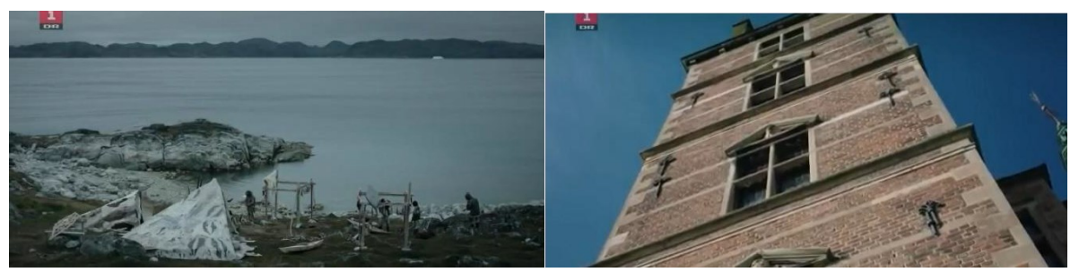
Image 2 and 3 The Inuit settlement in Greenland pre-colonisation and modernisation in muted colours vs the Danish modern buildings with bright colours.

(Wang, 2017). The voice-over commentary further emphasises the differences between safe Denmark and dangerous Greenland (Mortensen & Maegaard, 2019). This narrative aligns with the concept of 'Arctic orientalism' where Indigenous Arctic people are depicted as living in a lost "pure" world (Maegaard & Mortensen, 2018, p. 7).