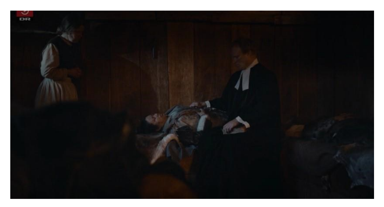
Image 10 In Episode 1, the Danish coloniser Hans Egede is also depicted offering relief for a dying Inuit.

narrator explaining that Egede believed God had abandoned him (Ep. 1, 55:30-56:00).