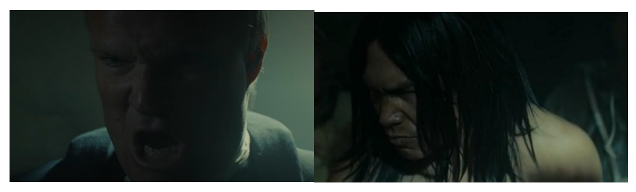
Image 8 and 9 In Episode 1, a reconstructed scene imagines Hans Egede bursting angrily into a religious ceremony and slapping the Inuit religious leader.