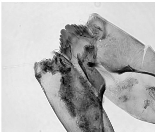
Fig. 2. Head capsule of subfossil chironomid species Polypedilum A-type (J. Tátošová).

The paleolimnology has undergone a major progress within last ten years, especially because of developments in statistics and methodology, the building up of high quality modern calibration data-sets, the improving of coring techniques, geochronology and subfossil remains identification. Paleolimnology provides the timing of past climate change, qualifies rates and magnitudes of these changes, and finally can determine the influence of human impact on freshwater ecosystems. During the last ten years, much attention has been focused on the use of various subfossil organisms preserved in lake