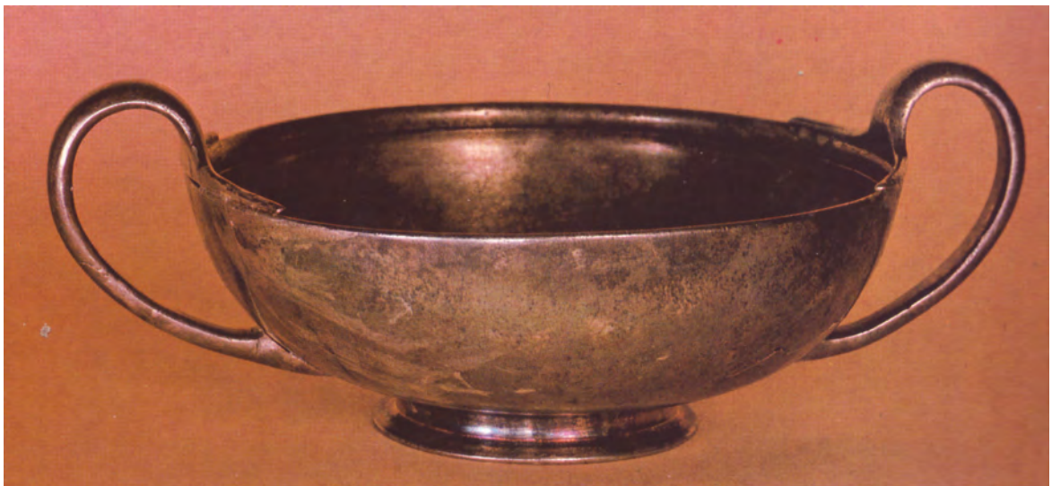
Pl. 6/1: Zohor - Grave 5. Silver kantharos (after KOLNÍK 1984).